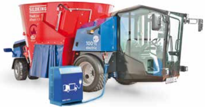
SILOKING TruckLine 4.0 eTruck is a 100 % electric, zero-emission, self-propelled feed mixer.

Reduced data maintenance work, improved data consistency, increased data quality and process stability to support business growth and internationalization